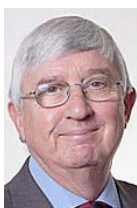
Dr Hywel Francis MP Vice-Chair