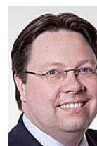
Dan Rogerson MP Secretary

We are delighted to publish this paper, which offers good practice guidelines on education for children and young people with Down syndrome.