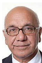
Mr Virendra Sharma MP Chair

The APPGDS is run by and for Members of the House of Commons and House of Lords and its key officers are: