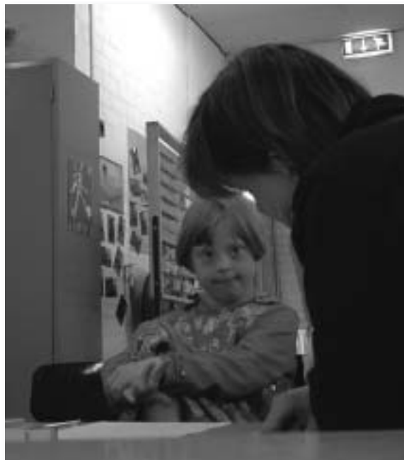
Annelot working one-to-one with a special educator outside the classroom

"The remedial teacher practises work with him in a one to one situation and then Caspar does the same work over again in the classroom. For instance with reading comprehension the two of them together fill out worksheets with multiple choice questions about a text and then later in the week Caspar does the same sheets over again in the classroom, all by himself." (teacher of Caspar; 13 years, grade 8)