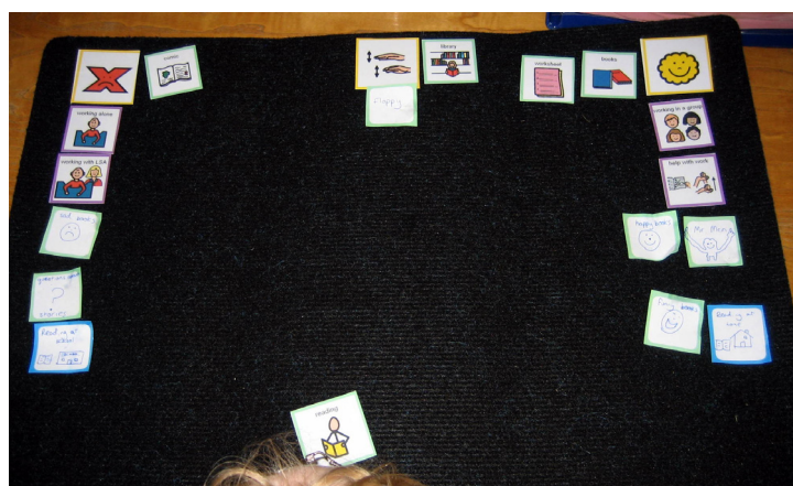
Figure 2 | Sub-mat; topic – reading