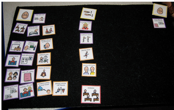
Figure 3 | Talking Mat used in mainstream Secondary School

Oxford Reading Tree scheme where the scheme did not seem to be meeting his needs and decisions had been made by adults for him to go back over the complete last stage of books he had read in order to 'work on comprehension'. Investigation using Talking Mats enabled him to show his displeasure at this move and a change of reading material was introduced with the intention of carrying out a subsequent mat afterwards in order to try to ascertain the child's opinion again. This child had a mainstream school placement and his behaviour was seriously challenging staff. He had limited speech but important things to say about his own education and choices.