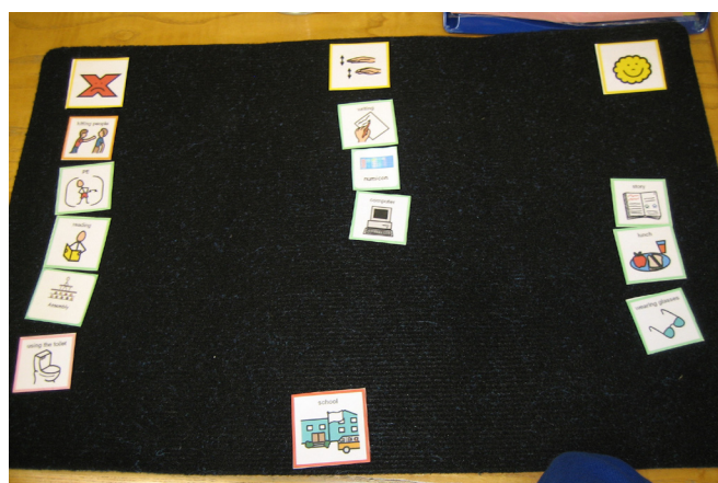
Figure 1 | Talking Mat used in mainstream Primary School; topic – school

This child was able to show that he was happy about the reading and worksheets at school, that he enjoyed working in a group on his reading, that he was happy to be helped with his reading, that he liked Mr Men books, happy books and funny books and also reading at home but that he was not keen on reading at school, working alone or questions about books. Further analysis suggested that the child had got to a stage in the